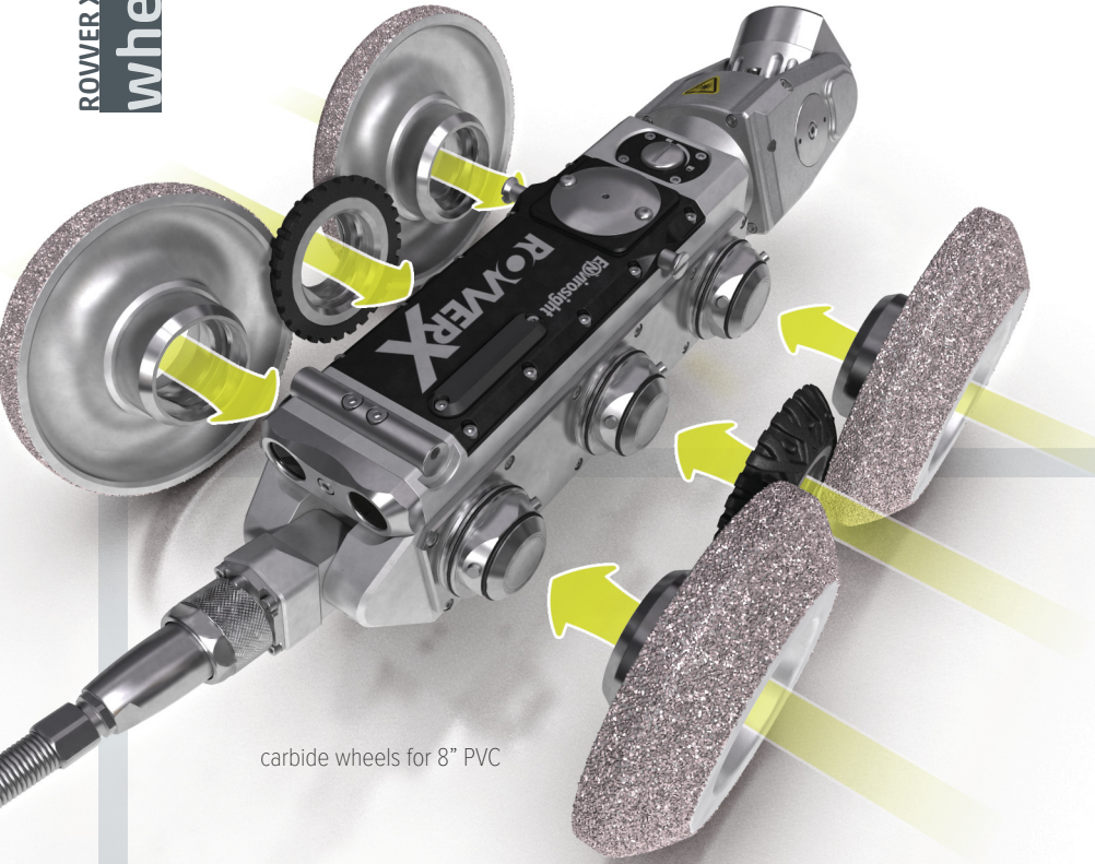
carbide wheels for 8" PVC

Quick-Change wheels for ROVER X attach with a click—no bolts, washers or tools.