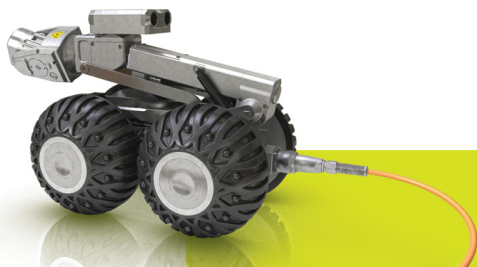
rubber wheels for 12" concrete